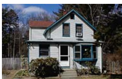
HANSON, MA Wicked Local Classifieds