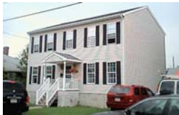
HULL, MA Wicked Local Classifieds