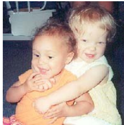
Toddlers throughout Illinois will be screened for potential mental health problems in the new Children's Mental Health Act of 2003.

I'm stunned to find out that the Illinois Children's Mental Health Partnership Preliminary Plan passed unanimously by the State Senate and with only five dissenting votes in the House. This massive intrusion mandates pregnant women and children be tested and evaluated for mental, social and emotional health concerns, then determine who is at risk and what drug(s) should be administered.