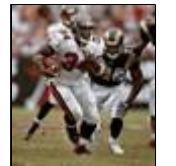
Bucs vs. Rams